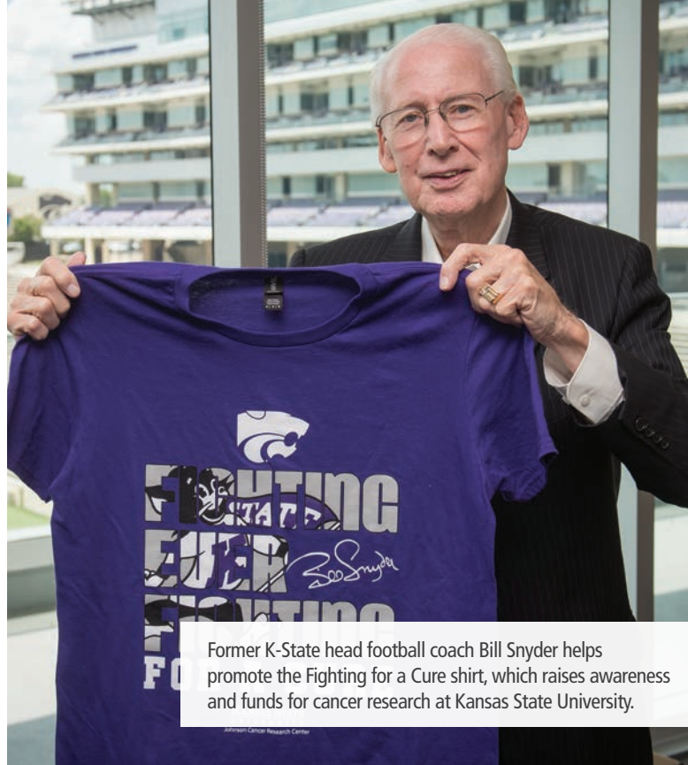
Former K-State head football coach Bill Snyder helps promote the Fighting for a Cure shirt, which raises awareness and funds for cancer research at Kansas State University.